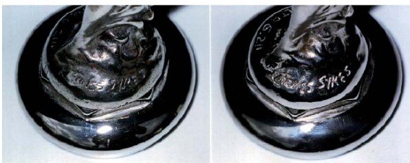
Left: an original Sykes mascot, somewhat pitted, but showing the appearance of inscriptions made in the wax pattern by a sharp point. Right: A reproduction mascot showing the appearance of lettering, after re-engraving with a fine dental bur. The writing is noticeably wider.

This is an excellent way to start spirited discussions, lose friends and, perhaps, provoke legal action. There are a number of vendors who offer mascots for sale, some with provenance that may be questionable. If you have paid a large sum for a