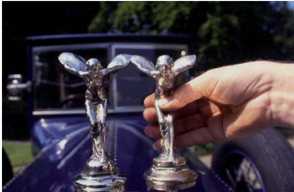
The mascot on the left is Nickel-plated and on a nickel-plated cap. The mascot on the right is a German silver or nickel-silver mascot, unplated, on a similar ally cap. The colour difference is slight but detectable.

The £2.8.0 continued until 4X, when the price was £2.17.0 but increased to £3.15.6 for the next few X chassis numbers. However, the mascot